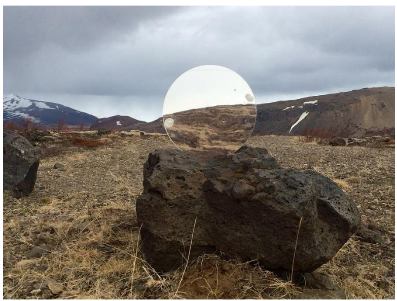
Matt Gee Chrome Sun 2015